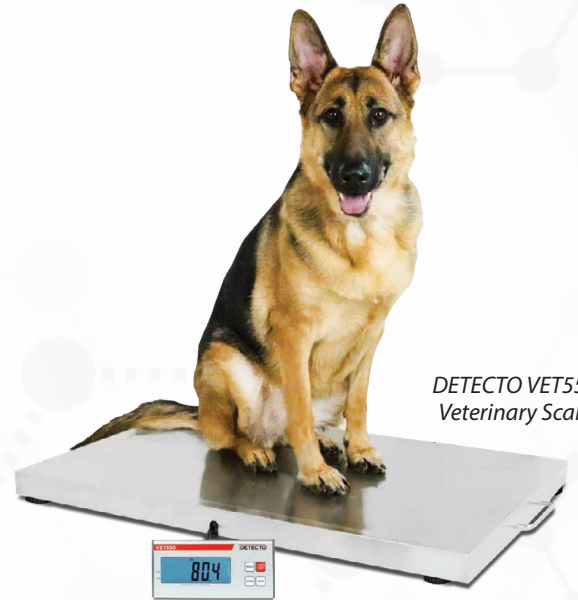
DETECTO VET550 Veterinary Scale