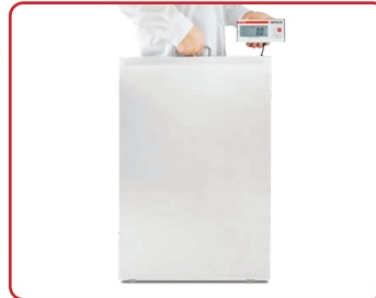
Built-in wheels and integral guide handle for easy transportation of scale to a new location