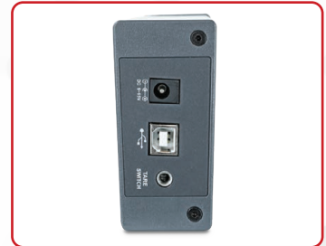
USB port for weight data transmission to an electronic medical records system