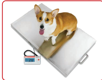
Large stainless steel 36 in L x 22 in W / 90 cm L x 56 cm W platform with remote indicator