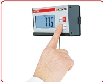
Included with wall-mount display bracket and mounting hardware