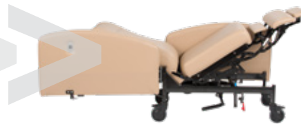
Secure-Glide™ for stress-free positioning

Exclusive to Verō , Winco introduces "Secure-Glide™" Trendelenburg control. Secure-Glide™ provides gentle patient positioning while preventing clinician strain. The controlled descent helps eliminate any need, or natural reflex, to strain to control the rapid patient positioning in emergency situations.