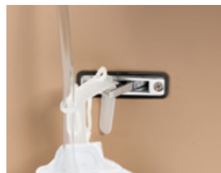
Accessory Hook (shown here with Foley bag)