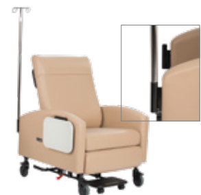
IV holder mount allows IV pole to remain relatively stationary when the swing arm (option) is in operation