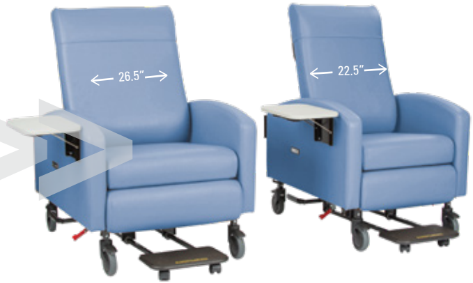
X-Large 500 lb Capacity