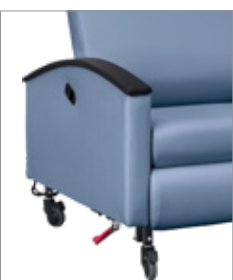
Urethane Arm Cap (option) >>

The Urethane cap option provides unique styling, firm support, and extended arm cap life.