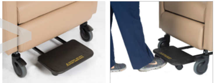
Footplate is easily positioned by foot.

Patients should be assisted at all times by a staff member when using the footplate.