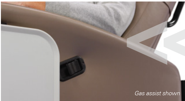
Gas assist shown

All Verō models feature a push back action in order to raise the footrest, and both offer convenient and comfortable infinite positioning of the back rest. Verō offers two methods of control of that positioning.