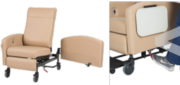
Upholstered arm shown

Facility utility is enhanced through the availability of two arm configurations. Standard fixed arms are cost effective, sturdy and durable. Optional swing arms allow 180 degree swing-away movement of the arm for convenient cleaning access and barrier-free patient transfer.