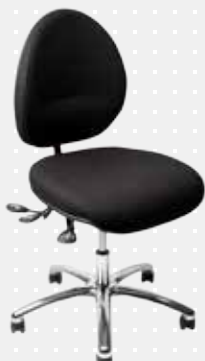
VELA Latin 200