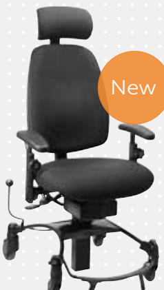
VELA Tango 510EI