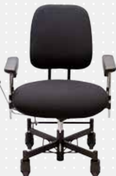
VELA Tango 300EI