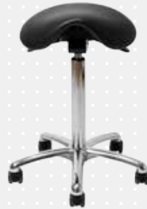
VELA Samba 400 with small seat