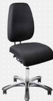
VELA Latin 400