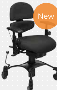
VELA Tango 500EI