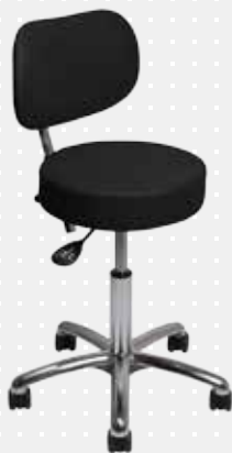
VELA Samba 520