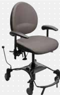
VELA Tango 200