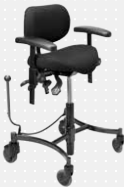
VELA Salsa 100