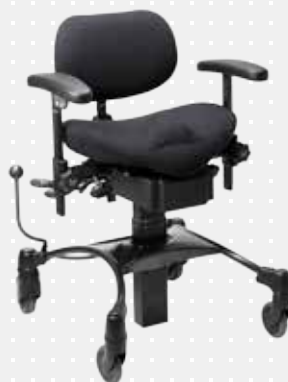
VELA Tango El Sit-stand