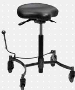
VELA Salsa 130