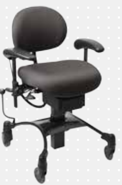
VELA Tango 100EI