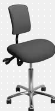
VELA Samba 150