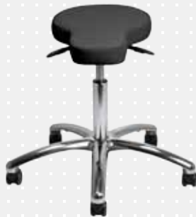
VELA Samba 530