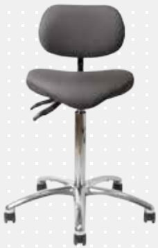
VELA Samba 100

VELA sit-stand chairs creates a stable, high work space and supports an ergonomic work posture. A sit-stand chair is perfect as a relieving chair in a work day with both standing and seated work - at home and at the work place.