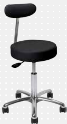
VELA Samba 510