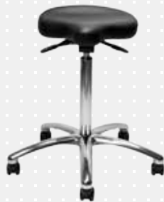
VELA Samba 130