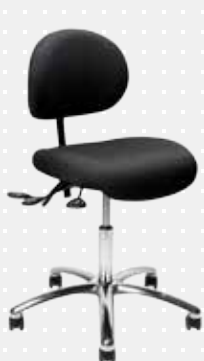
VELA Latin 100