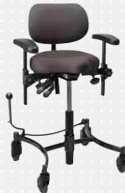
VELA Salsa 120