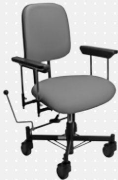
VELA Tango 300