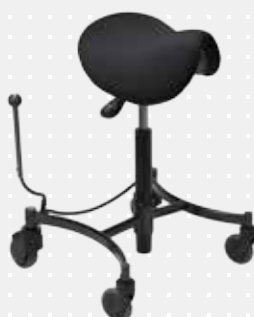
VELA Salsa 400