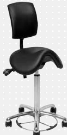
VELA Samba 400 with S150 backrest