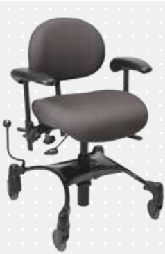
VELA Tango 100

VELA Tango is a series of customised chairs developed for people with disabilities to be able to remain active and be independent at home and at the workplace. VELA Tango chairs have a unique central brake providing a safe and stable work space.