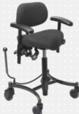
VELA Salsa 110