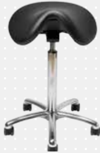
VELA Samba 400