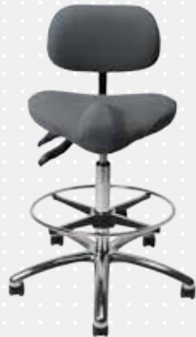
VELA Samba 110