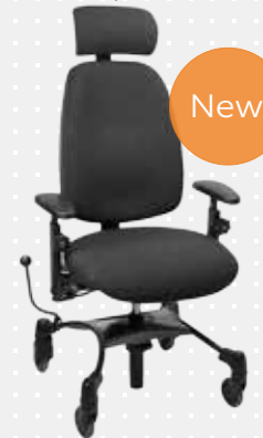
VELA Tango 510