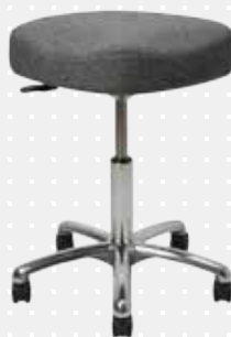
VELA Samba 410