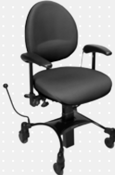
VELA Tango 200EI