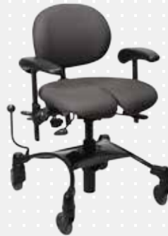
VELA Tango Arthrodesis Split seat