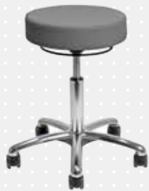
VELA Samba 500

All stools and sit-stand chairs can be supplied with both hand-operated or foot-controlled height adjustment. The chairs can be adapted to the individual user via, e.g. backrests, wheels and brakes. All basic chairs have 360° seat rotation.