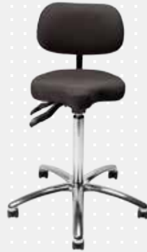
VELA Samba 120