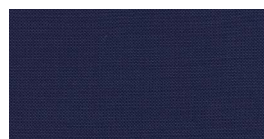
SILVERTEX SAPPHIRE BLUE