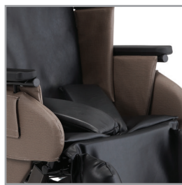
Padded Thigh Strap