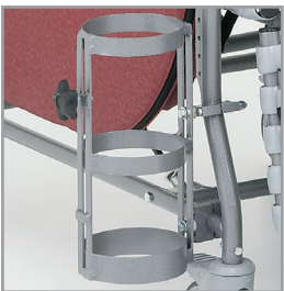
O 2 Holder