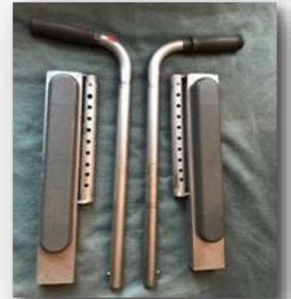
Original concept - Buddy Bar version 1.0

Designed a rough concept in their garage – the genesis of “Buddy Bars”