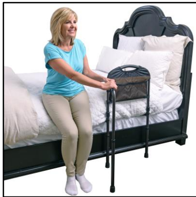
Stander Mobility Bed Rail

2019) Web and patent searches revealed no other lightweight and transportable product exists and at an affordable price