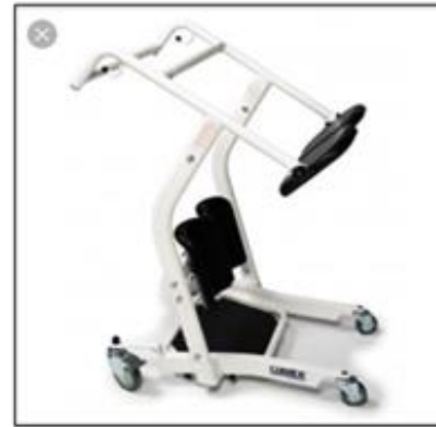
Lumex Stand Aid Transport