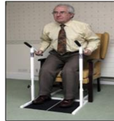
Home&Medical Stand Easy Frame