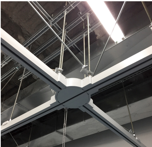
Typical Installation using Unistrut hardware and 1/2" (12.7 mm) threaded rods.