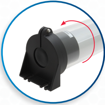
120 ° Adjustable Illumination