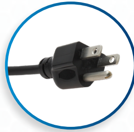
6 ft Power Cord w/ 100V Plug