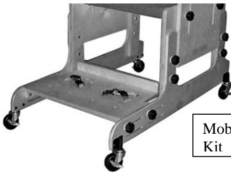
Mobile Base Kit