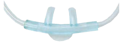
Curved SOFT 007