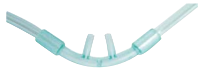
Dual Lumen Consaver Cannula SOFT307