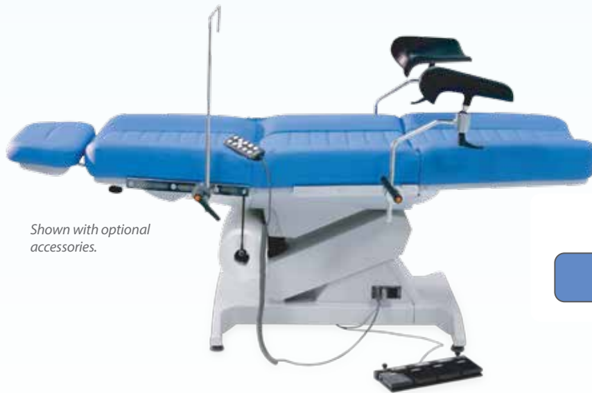
Shown with optional accessories.