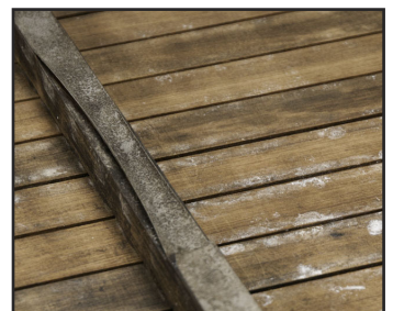
If by any chance your mat gets to the point of the one pictured above, not to worry; a deep cleaning and some additional maintenance will restore your piece to its original finish.