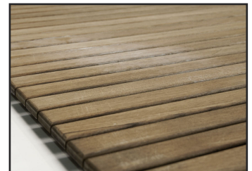
If your mat is showing white soap scum and signs of graying, a quick cleaning will solve this problem.