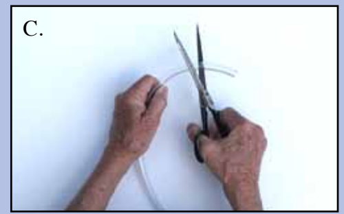
A common household scissors (photo "C" above) is all that's needed for the installation – to cut the transparent O_2 piping to the desired lengths for your individual home layout.

pling is plugged into any "Oxygen Out" receiver, the Flow Controller senses which station requires the oxygen flow. A conventional cannula of any length of up to 15 feet can be used at any station. Only one station can be used at a time.