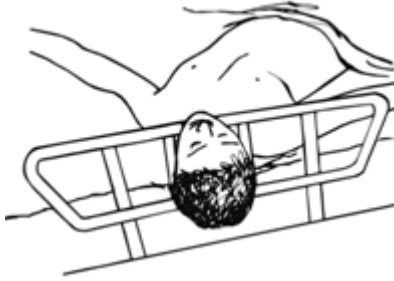
Zone 1 - Entrapment within the rail