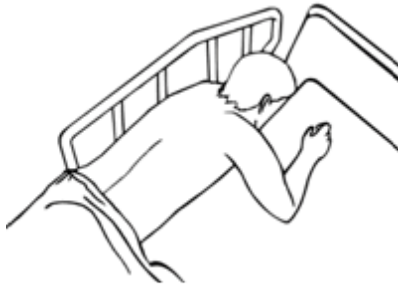
Zone 3 - Entrapment between the rail and mattress