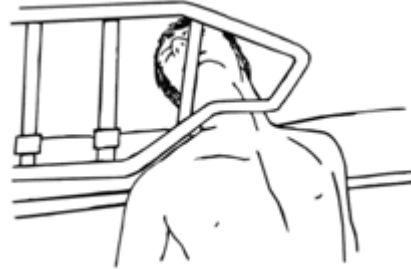
Zone 4 - Entrapment under the rail, at the end of the rail