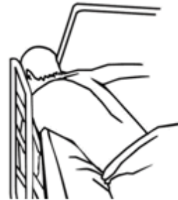
Zone 6 - Entrapment between the end of the rail and the side edge of the head or foot board