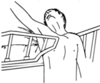
Zone 5 - Entrapment between split bed rails