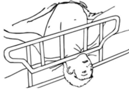
Zone 2 - Entrapment under the rail, between the rail supports or next to a single rail support