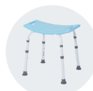
DELUXE SHOWER BENCH