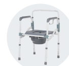
FOLDING POWDER COATED ALUMINUM COMMUNE-3 IN 1