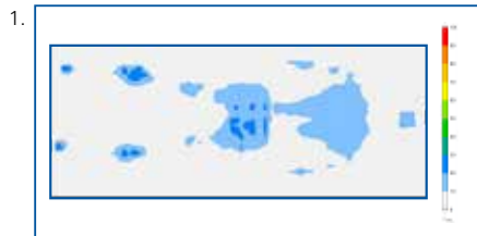
1. Test shows subject in supine position demonstrating contact measurement between key pressure points using BodiTrak mapping technology on the SPS1084 support surface. Subject: Male 5'11", 185 lb.