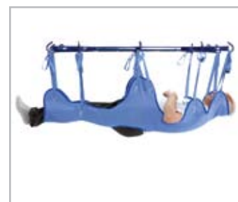
Stretcher sling with commode aperture