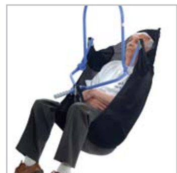
All-day mesh sling