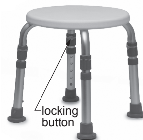
2060R Bath Stool assembled