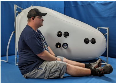
Model is 6'1" 250 LBS