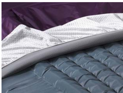
Outer Removable Coverlet and Inner Air-Delivery Cover

Easy Air’s exclusive “Air Diffusion Matrix” Coverlet design maximizes removal of excess moisture (i.e., perspiration) from the user’s skin. Moisture passes in vapor form down through the Coverlet, where a continuous air current from the cover takes it away before it can re-form as liquid.