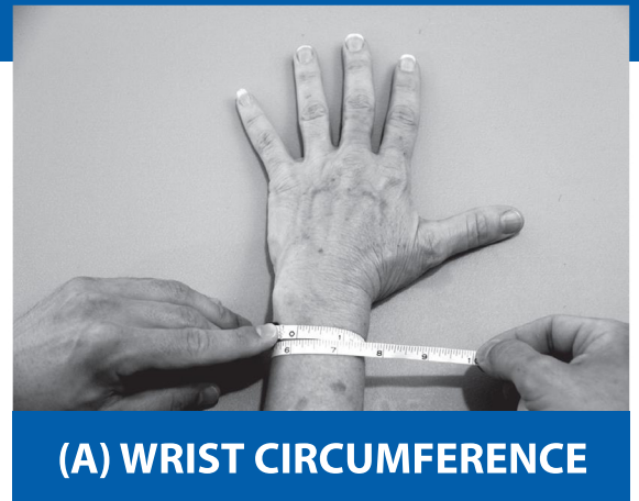
(A) WRIST CIRCUMFERENCE

(A) Wrist Circumference: measure around wrist just below wrist bone.