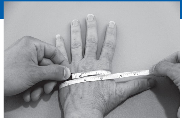
(A) HAND CIRCUMFERENCE

(A) Hand Circumference: measure around the hand, just below the knuckles.