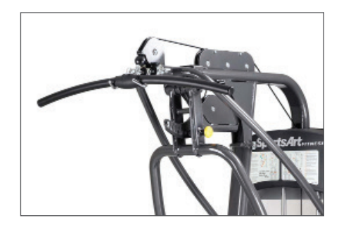
Innovative pulling arm has an additional setting to allow for chest press increasing the number of available exercises.

Our dual function series allows users to work at least 2 major muscle groups per machine maximizing both space and convenience.