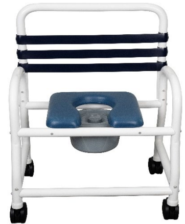
DNE – 310-3TWL 310 LBS. CAP.