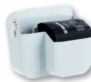
Basket for accessories including cable management