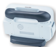
Portable Device with an easy to hold handle