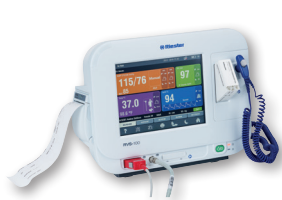
Integrated thermal printer (optional)