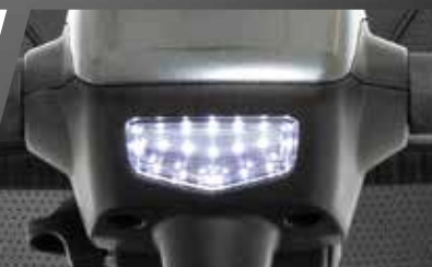
LED headlight in tiller