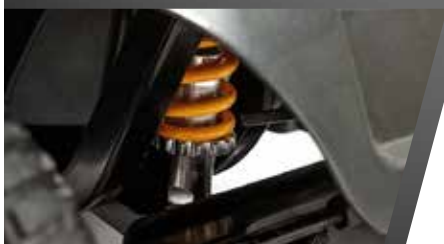
Pride's CTS Suspension