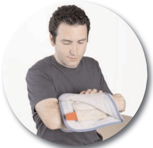
halfsize with terry cover shown in use