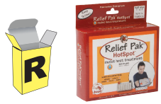
Y large spine