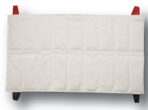
X small spine