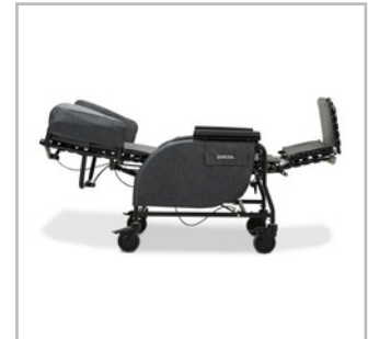
Full tilt and recline functionality provides superior positioning