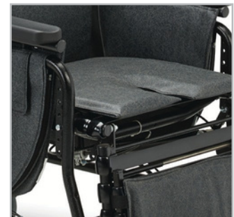
Adjustable seat surface height adapts the Midline to support users at multiple care levels