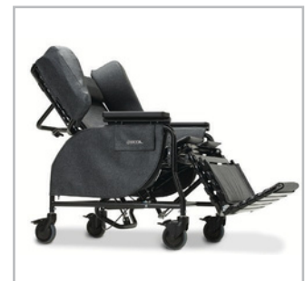
Tilt-in-space enhances comfort