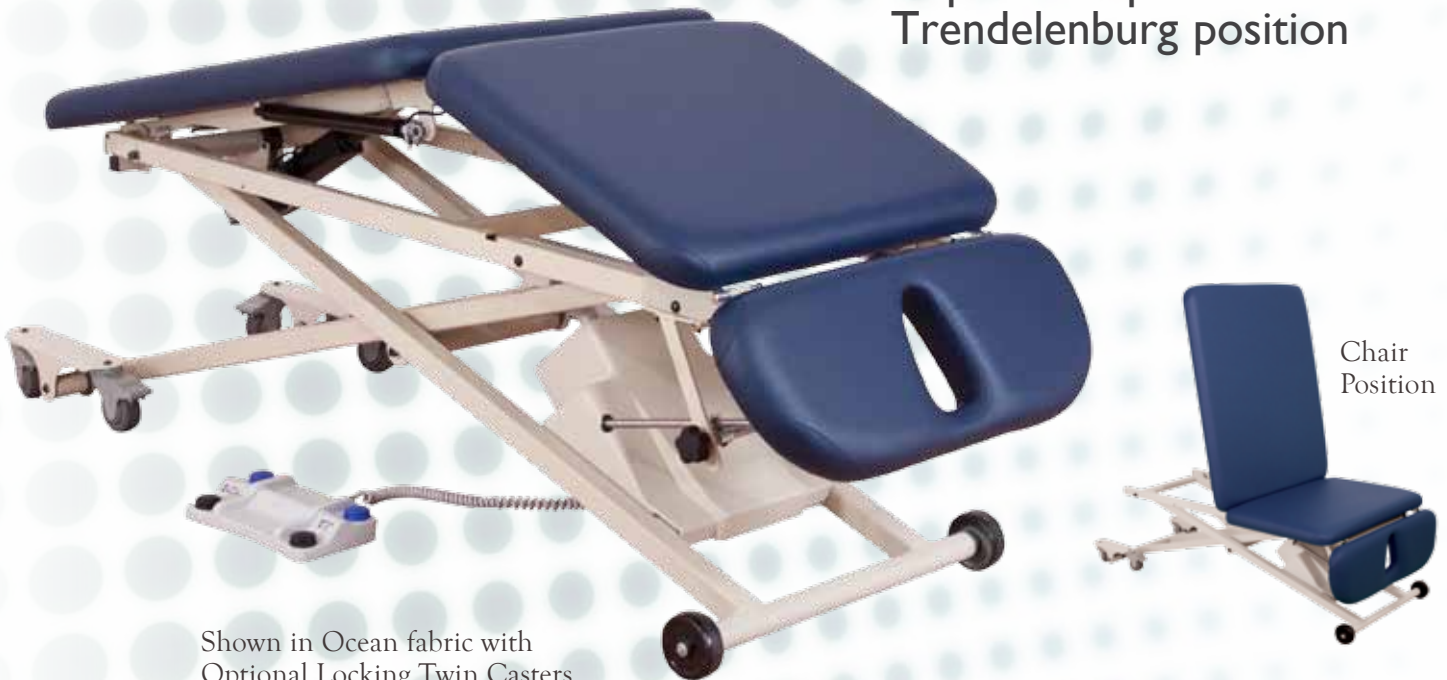
Shown in Ocean fabric with Optional Locking Twin Casters