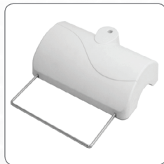
Weighted Table Base Item # 26501-WB