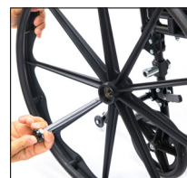
Quick release wheels