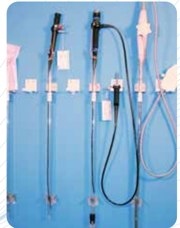
4. Wall storage of clean devices.