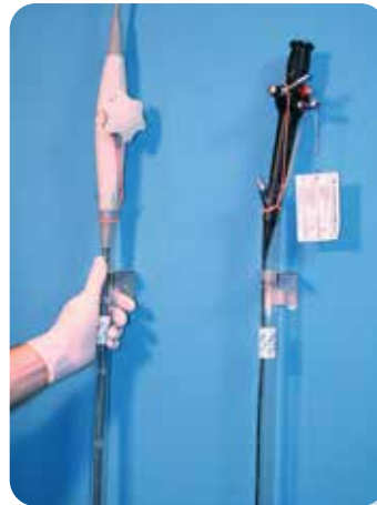
3. Clip the ProShield with device into the bracket.