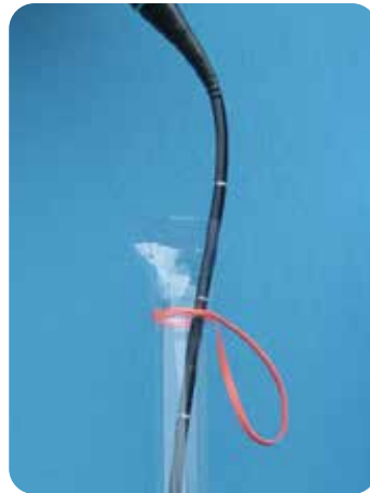
2. Insert flexible shank into ProShield and stretch rubber band over the handle.