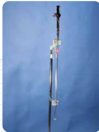
6. Stand for quick storage and easy transport.