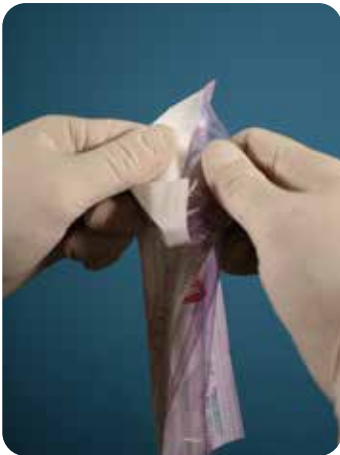
1. Open the top of the peel-pack.