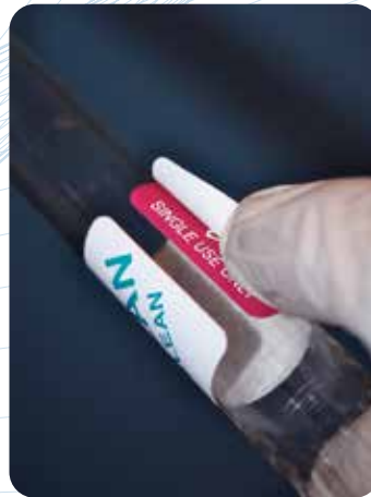
7. Remove the "CLEAN" label when procedure starts.