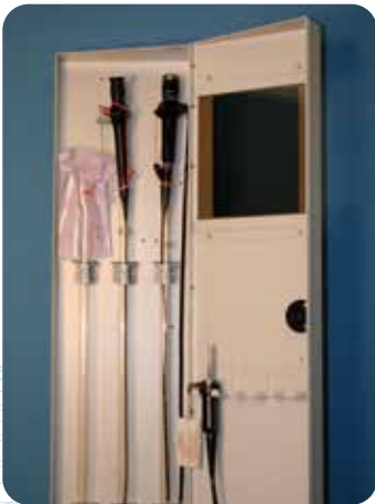
5. Cabinet storage of devices in ProShields.