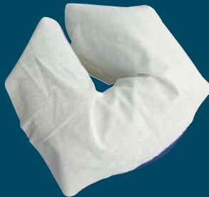
FLAT DISPOSABLE FACE REST COVERS