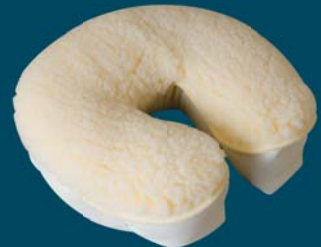
FACE REST FLEECE