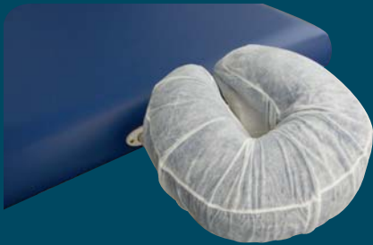
FITTED DISPOSABLE FACE REST COVERS

maintain a hygienic barrier for Oakworks Prone Pillow