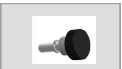
Door Lock Knob