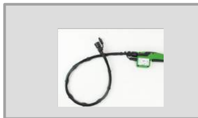
Electrostatic sprayer wand