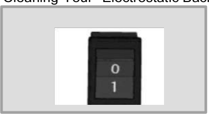
Power Switch Backpack

Manufacture Recommendation: Use Clean Water When Cleaning Your Electrostatic Backpack Sprayer