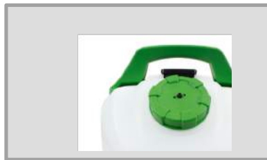
Backpack Tank Cap