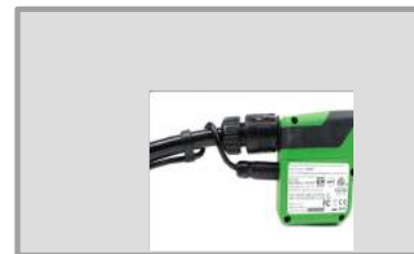
Quick Release Connectors