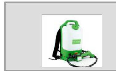
Backpack with Handle