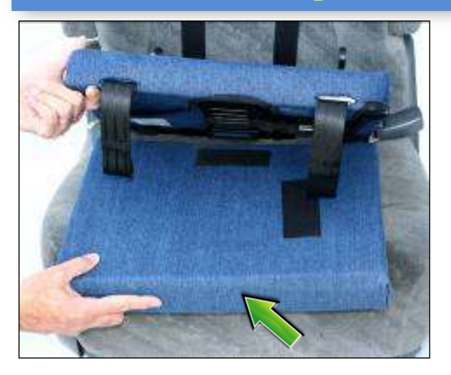
Hip inflection wedge