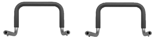
LEFT AND RIGHT PADDED ARMS