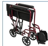
Flared handles back to fold down flat