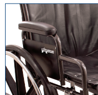
Removable, desk length, padded arms

The ProBasics K7 Heavy Duty Wheelchair features a robust design to accommodate patients with wider seat and higher weight capacity requirements. With seat widths from 24 to 28 inches, a weight capacity of 450 - 600 pounds and a heavy-duty slide tube frame, the ProBasics K7 offers a rugged yet attractive option for the bariatric patient population.