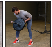
T-Bar Row PPRTB