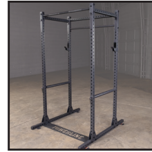
Power Rack PPR1000