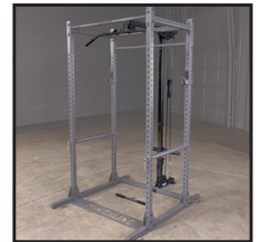
Lat Attachment PLA1000