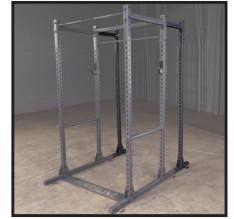
Power Rack Extension PPR1000EXT