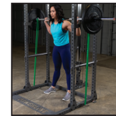
Band Pegs PPRBP