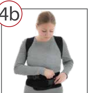
HELPFUL TIP Although the material of the posture corrector is breathable and skin friendly, to ensure your comfort we recommend wearing an undershirt.