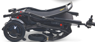
East One-Step Folding for Transport

FOLD & STOW! Compact Dimensions 30.2" x 22.25" x 14"