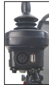
Convenient USB Charging Port