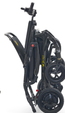
Stands on End for Storage