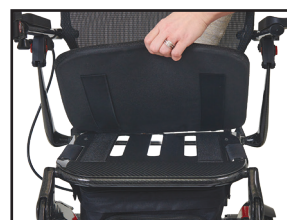
Removable 1.25" Thick Padded Seat