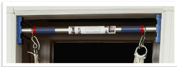
PROPERLY INSTALLED HARD-MOUNT UNIT

Please Note: The support bar is designed to be installed in a doorway that is between 29" and 36" wide!