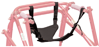
Soft Seat Harness

Adjustable padded pelvic support assists weight bearing, properly positions user's pelvis and provides freedom of movement.