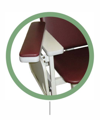
Adjustable height armrests