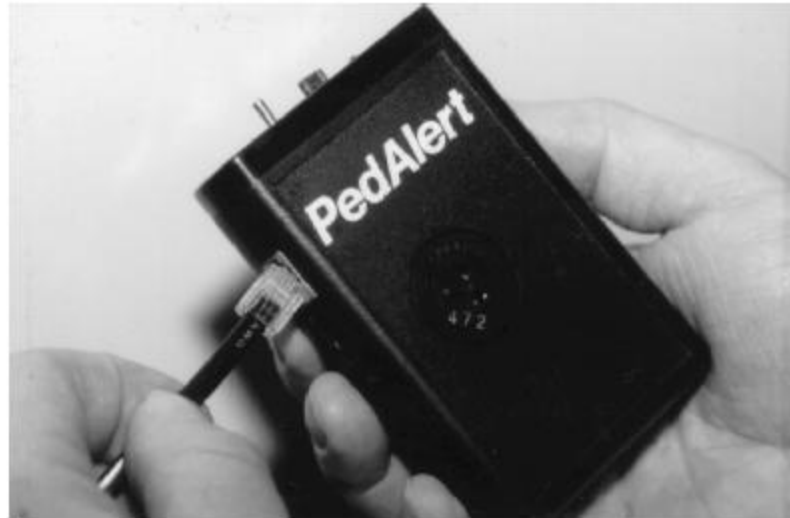
Figure 1. The wire needs to be firmly connected for proper operation.