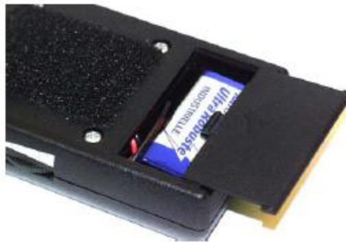
Figure 6. A standard 9V battery is easily replaceable.