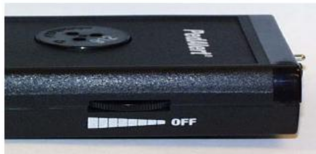
Figure 2. On/Off switch and warning tone volume are set with the same control.