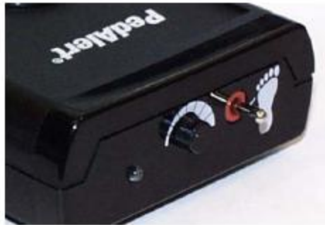
Figure 5. The weight threshold knob adjusts the force required to activate the warning tone.