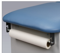
030– Paper Dispenser