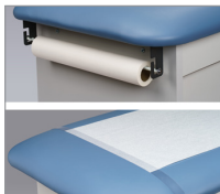
034– Paper Dispenser & Cutter Combo