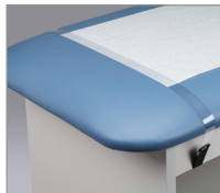
040– Paper Cutter