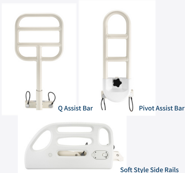
Q Assist Bar