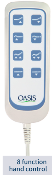
8 function hand control