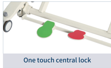
One touch central lock