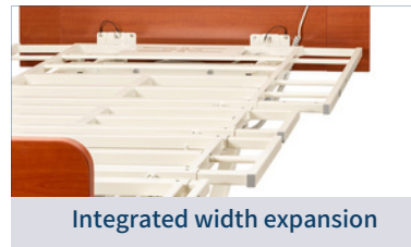
Integrated width expansion