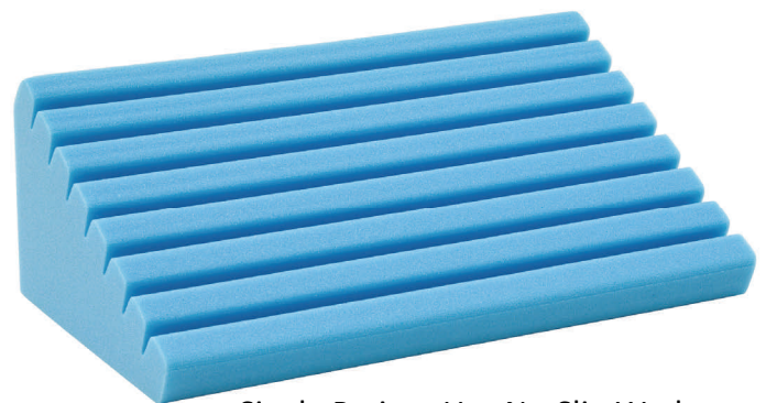
Single Patient Use No-Slip Wedge