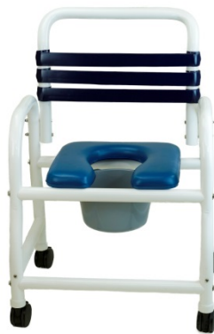
DNE – 122-3TWL 385 LBS. CAP