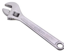
Crescent Adjustable Wrench