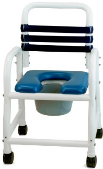
DNE – 118-3TWL 310 LBS. CAP.