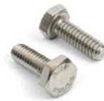
(4 each) 1/4-20 x 4 Hex C/S Stainless

For Side Panels – will secure the width left to right with the cross braces 3 per side