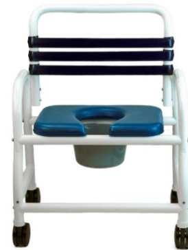
DNE – 126-4TWL 435 LBS. CAP

Please remove all the components from the package / box and lay them on the floor / table etc. The list below will detail all components / parts.