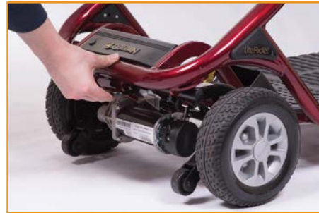
To separate the rear transaxle from the frame, squeeze the release lever located on the underside of the frame