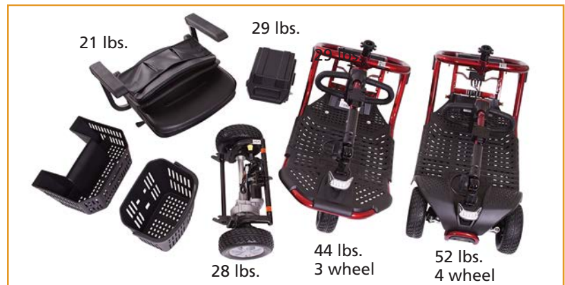
Disassembles into six pieces for transport and storage! No wires to connect or disconnect!