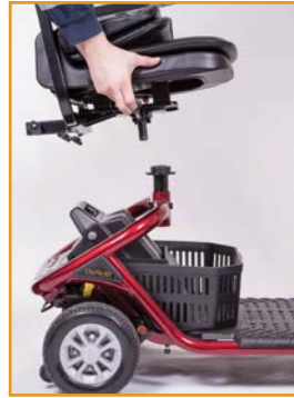
Pick up the seat